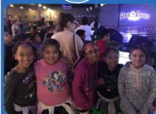
CHA Bowling / Lights on After- school Event