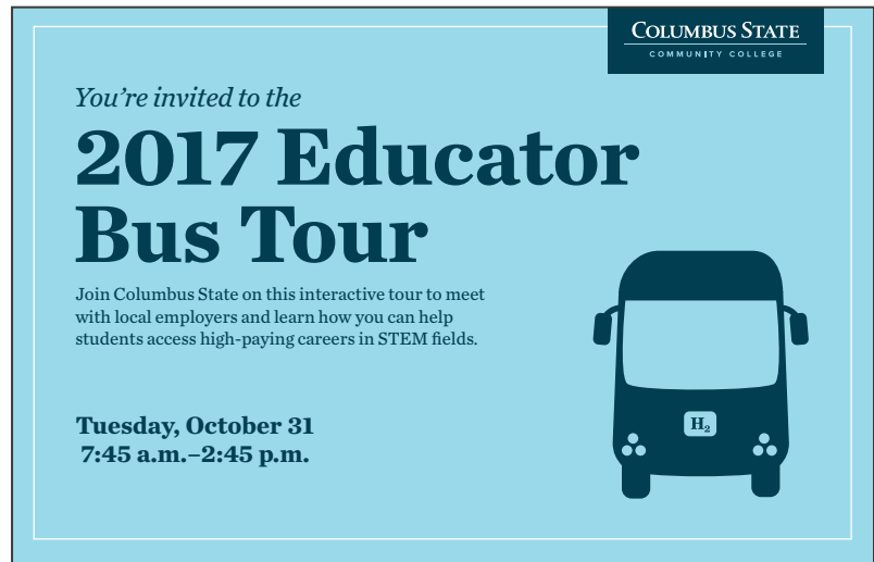
▲ Cover of a mailer that was sent to local educators to invite them to the Educator Bus Tour.