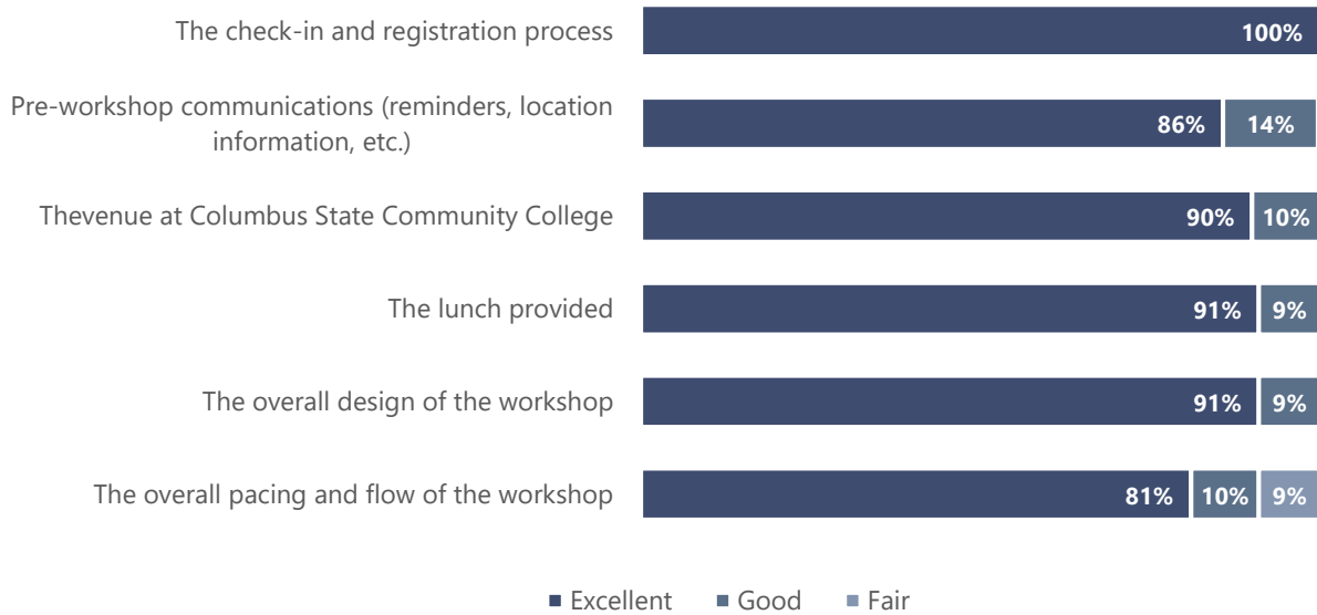
Figure 1. Response frequencies for all respondents to the question, “Please rate each of the following aspects related to the overall design and implementation today’s workshop.” (N=21)

Every aspect of the design and implementation was rated as “Excellent” by most participants