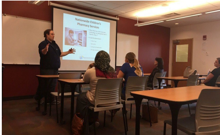
Engaging Industry Speakers From Neighboring Pharmacies