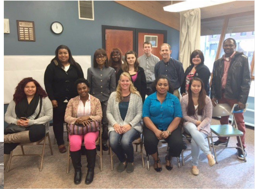
Tours of Local Pharmacies