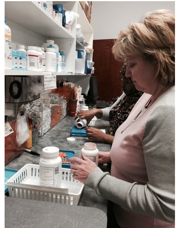
Tours of Local Pharmacies