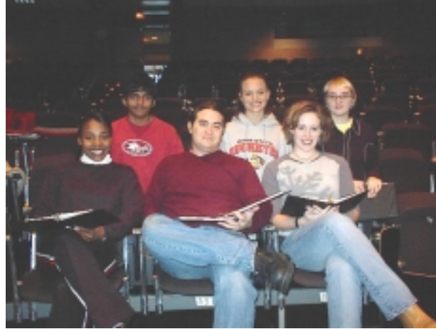
The cast of Suddenly Last Summer